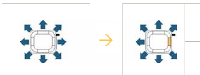
change room configuration/refurbishment

The optional closure kit makes it possible to achieve 2-way, 3-way and 4-way flow patterns, allowing the round flow cassette to be installed in a corner, next to a wall or in a confined space. 23 different air flow patterns are possible, and since the flaps can be easily closed via the wired remote controller, you will never need to change the unit's location when rearranging your interior.