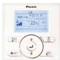
Wired remote control BRC1E52A/B (optional)